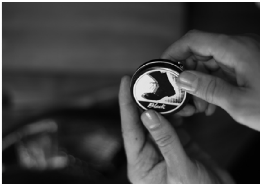
Darkening Process, SFpublishing 2024