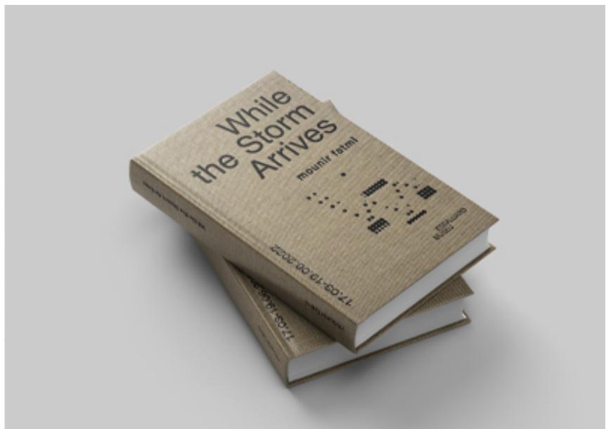
While the Storm Arrives, mounir fatmi, SF Publishing, 2022, Hard cover