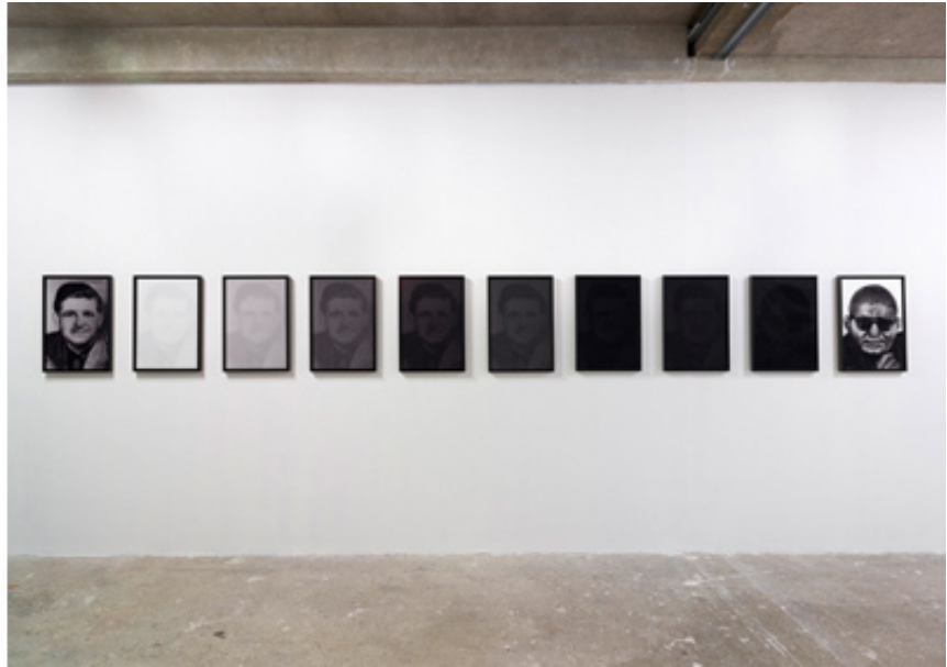
2013-2014, serie of 10 C-Prints, 60 x 40 cm. Exhibition view from Walking on the light, CCC Tours, 2014, Tours. Courtesy of the artist and Ceysson & Bénétière, Paris. Ed. of 5 + 2 A.P.