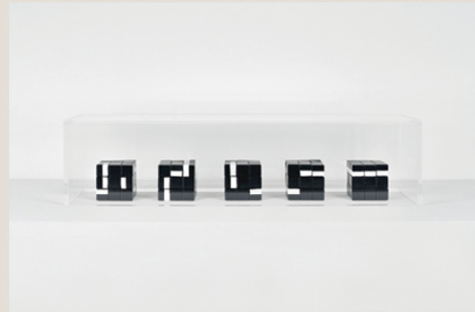
Brainteaser for Moderate Muslim , 2004, acrylic on rubiks cubes, 54 x 11 x 13,5 cm.

In his creative process, Mounir Fatmi uses a variety of media and materials, and appropriates objects at hand, in attempts to question their materiality and attributed function. His artworks challenge the thingness of things, as they take the form of known objects, but occupy meanings beyond their shape and instrumentality; in Brainteaser for Moderate Muslims , the commonplace colourful cube is transformed, redirected towards new possibilities of its materialism. The title suggests a playful reference to The Kaaba, a pre-Islamic monument rededicated by the prophet Muhammad, while the work as a whole invites critical thinking, with tones of political reflection.