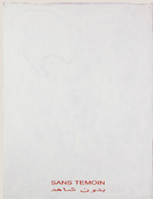
No Witness, (Portrait format) series started in 1996, 1995 paintings erased in 1996, 25,5 x 38 cm