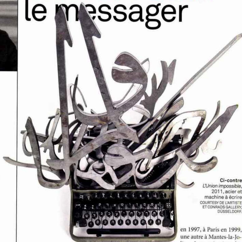
Ci-contre L'Union impossible, 2011, acier et machine à écrire