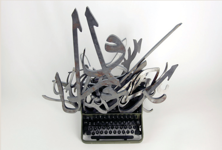
The Impossible Union, 2011, arabic calligraphies of steel, hebrew typewriter. Courtesy of the artist and Collection of the Kunstpalast Museum, Duesseldorf. Photo credit : Mounir Fatmi

I live in Paris and when I am in the USA, I am a French Artist, but when I am in France, I am a Middle Eastern or African artist. I am always from somewhere else, wherever I am! I see here an urgency to understand the other, to accept and to learn with the other, and art can be a way to facilitate this.