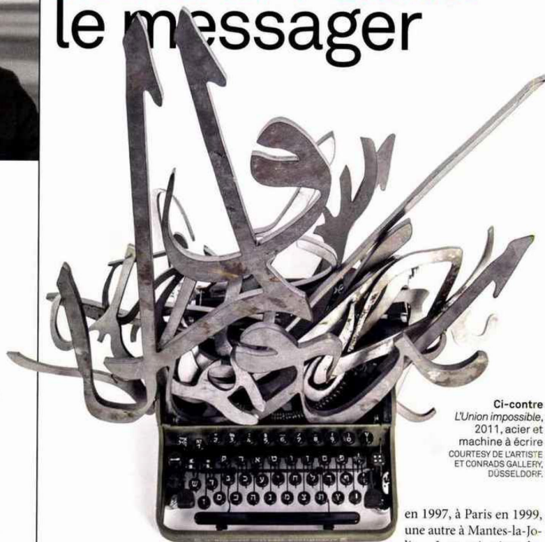
Ci-contre L'Union impossible, 2011, acier et machine à écrire