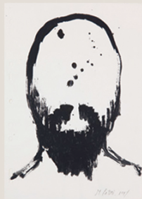
Face, 1999, serie of 13 drawings, ink and acrylic on paper, 29,7 x 21 cm. Private collection.