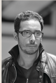
A portrait of Mounir Fatmi

In Between the Lines , a steel circular saw blade becomes the inscription surface for Quoran verses, which undergo a process of being emptied of semiotic content and rendered decorative elements. The defining qualities of both the object and of language are suspended, and the image becomes the new bearer of knowledge.