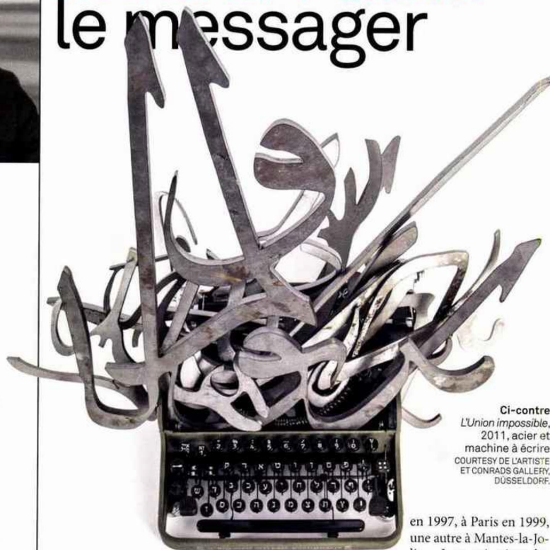
Ci-contre L'Union impossible, 2011, acier et machine à écrire

Pour Mounir Fatmi, tout est affaire de langage, de transmission, mais aussi de leur perte. Langage des objets inutiles qu'il découvre enfant au marché aux Puces de Casabarata à Tanger, langage visuel du télescopage entre passé et présent. Ce bric-à-brac de l'enfance lui ouvre le regard sur le mélange, la cohabitation, le choc des cultures, l'art du prélèvement et de la recombinaison, le choc du temps et de la mort annoncée. Avec ces outils désormais sans usage, l'artiste constitue de nouvelles calligraphies et des « archives » dans lesquelles il ne cesse de puiser. La pratique du graphisme publicitaire pendant six ans, où il peaufine le remixage d'images, le conforte dans son désir de liberté et de retour à la pratique artistique. Il enchaîne les résidences en France, à Lille