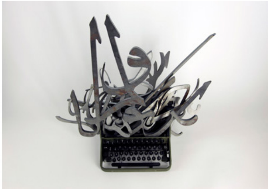
2011, arabic calligraphies of steel, hebrew typewriter. Exhibition view from The Angel's Black Leg, Conrads Gallery, 2011, Düsseldorf. Courtesy of the artist and Ceysson & Bénétière, Paris. Ed. of 5 + 1 A.P.