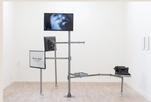
Deconstruction Structure N°1, 2013-2014, Typewriter, hammers, A4 paper on office desk, video on flatscreen, Bilboquet game, typed sheets. Courtesy of the artist and Goodman Gallery, Johannesburg-Cape Town. Exhibition view from Merchant of Dreams.