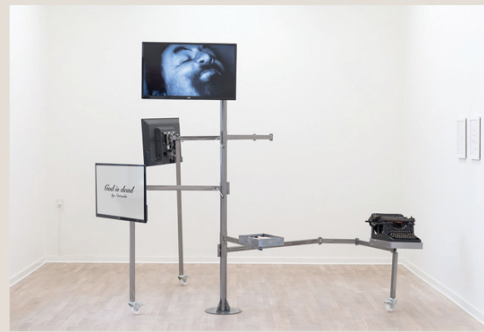
Deconstruction Structure N°1, 2013-2014, Typewriter, hammers, A4 paper on office desk, video on flatscreen, Bilboquet game, typed sheets. Courtesy of the artist and Goodman Gallery, Johannesburg-Cape Town. Exhibition view from Merchant of Dreams.