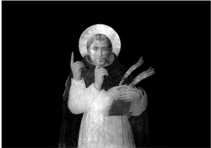
2011, France, 5 min 04, HD, B&W, stereo. Exhibition view of the Angel's Black Leg, Conrads Gallery, 2011, Düsseldorf. Ed. of 5 + 2 A.P.

Très loin dans la nuit des temps moyenâgeux, la torture existait déjà, avec grande sophistication. Liée à la folie et au plaisir de ceux qui torturent : modèle du genre, la légendaire comtesse hongroise Elizabeth Bathory. Ou alors, liée à la religion : ainsi, plus avant dans l'Histoire, au 13ème siècle, l'Inquisition faisait rage à travers l'Europe, avec son cortège de tortures institutionnalisées par la papauté. Eliminer les hérétiques. Amener l'Europe entière à la même foi. Supprimer les Cathares. Faire admettre à toutes et à tous leurs erreurs, accorder parfois le pardon, supplicier parfois et brûler les corps de celles et de ceux dont l'esprit libre voulait penser autrement. Des sorcières, notamment, auprès desquelles pourtant les inquisiteurs allaient apprendre leur métier (Carlo Ginzburg). Tout cela pour la bonne cause, toujours : celle de la foi juste. Modèle du genre : Saint Pierre de Vérone, qui depuis l'enfance prêchait cette juste foi, y compris au sein de sa propre famille. Inquisiteur, il tortura tant et si bien qu'à un moment donné il prévint lui-même que lui aussi mourrait assassiné. Ce qui ne manqua pas d'arriver, par un coup de hache sur le sommet de son crâne, un meurtre qui fut suivi de la sanctification de Pierre après que, mourant, il eût trempé son doigt dans son propre sang pour écrire sur la terre « Je crois en un seul Dieu ».