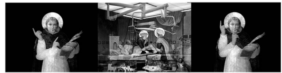
1. mounir fatmi The Silence of Saint Peter Martyr, 2011 video HD in bianco e nero con audio, 5'04" edizione di 5

During the opening ceremony of Thursday, October 26th at 7 pm, a performance at the presence of the artist will be held. It will be built around his installation Constructing Illusions , a participatory work that plays on the equilibrium between imagination and reality: concepts that often mingle with each other until they manage to completely exchange meanings.