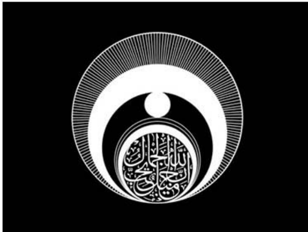
Images forming part of the video in- stallation - Galerie Hussenot © mounir fatmi -

The work was meant to be part of the contemporary art festival Printemps de Septembre, and Fatmi was taking part for the first time.