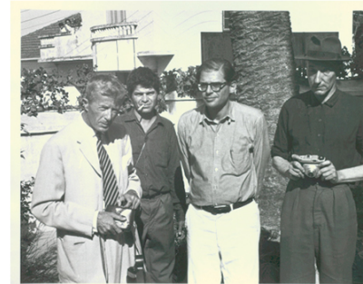
L-R: Paul Bowles, Gregory Corso, Allen Ginsberg, and William Burroughs in Tangier in 1961