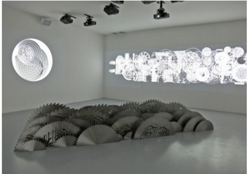
2009-2010, videos, sound, saw blades in steel. Exhibition view of Told, Untold, Retold, Mathaf Arab Museum of Modern Art, 2010, Doha. Courtesy of the artist and Art Front Gallery, Tokyo. Ed. of 1 + 1 A.P.