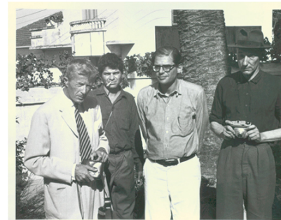
L-R: Paul Bowles, Gregory Corso, Allen Ginsberg, and William Burroughs in Tangier in 1961