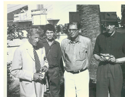
L-R: Paul Bowles, Gregory Corso, Allen Ginsberg, and William Burroughs in Tangier in 1961