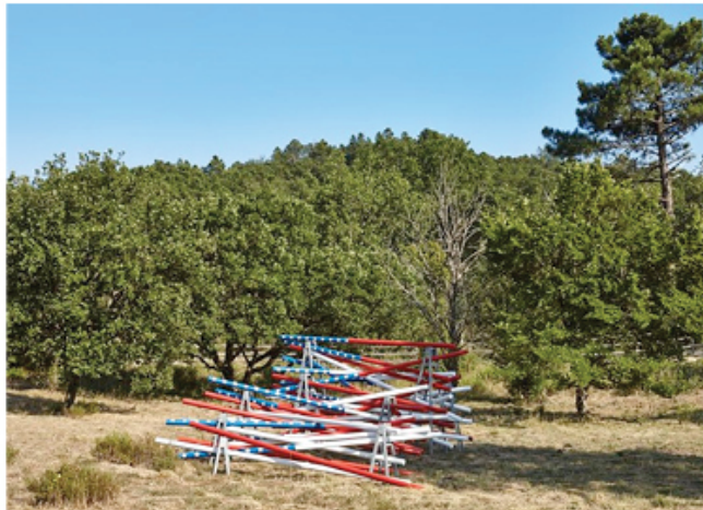
I Like America – Tribute to Jacques Derrida (J'aime l'Amérique – Hommage à Jacques Derrida); courtesy the artist and FNAC (France)