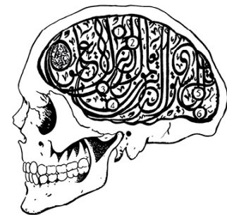
Hard Head (courtesy the artist and the Collection Les Abattoirs at the Musée d'Art Moderne et Contemporain in Toulouse, France)