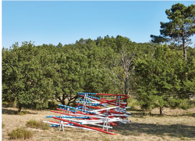
I Like America – Tribute to Jacques Derrida (J'aime l'Amérique – Hommage à Jacques Derrida); courtesy the artist and FNAC (France)