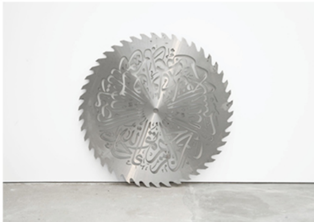
Between the Lines