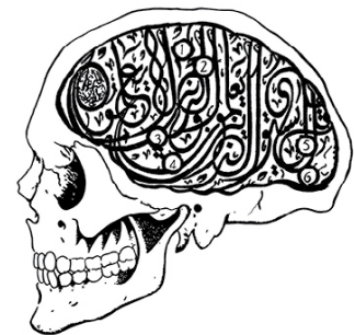
Hard Head (courtesy the artist and the Collection Les Abattoirs at the Musée d'Art Moderne et Contemporain in Toulouse, France)