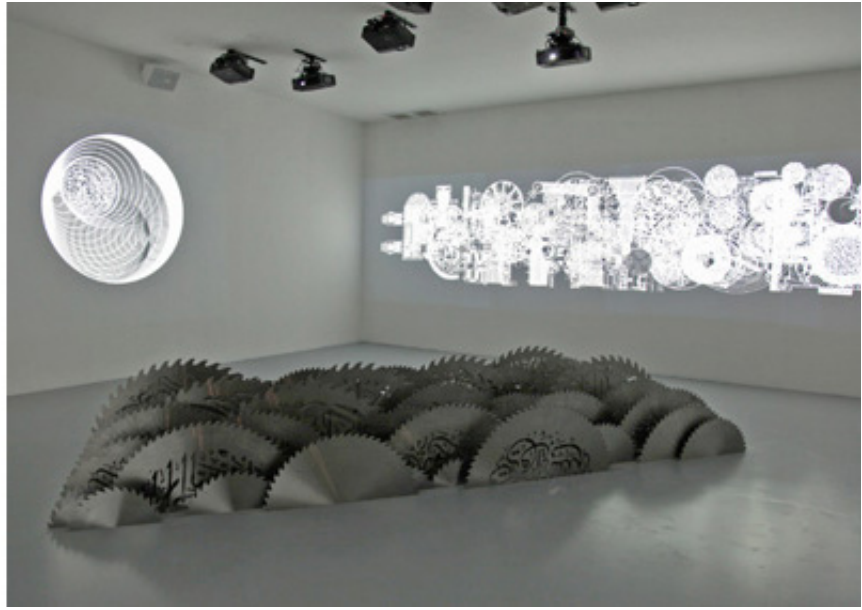
2009-2010, videos, sound, saw blades in steel. Exhibition view of Told, Untold, Retold, Mathaf Arab Museum of Modern Art, 2010, Doha. Courtesy of the artist and Art Front Gallery, Tokyo. Ed. of 1 + 1 A.P.