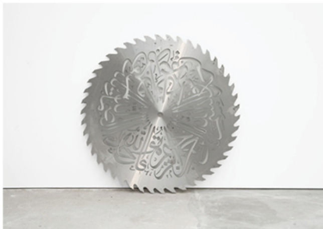
Between the Lines