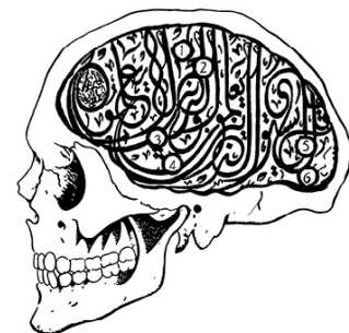
Hard Head