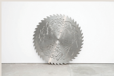
Between the lines , 2010, saw blade in steel, 150 cm.

In Between the Lines , a steel circular saw blade becomes the inscription surface for Quoran verses, which undergo a process of being emptied of semiotic content and rendered decorative elements. The defining qualities of both the object and of language are suspended, and the image becomes the new bearer of knowledge.