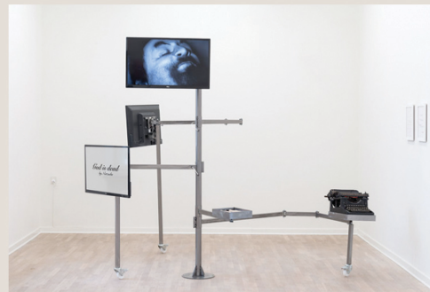
Deconstruction Structure N°1, 2013-2014, Typewriter, hammers, A4 paper on office desk, video on flatscreen, Bilboquet game, typed sheets. Courtesy of the artist and Goodman Gallery, Johannesburg-Cape Town. Exhibition view from Merchant of Dreams.