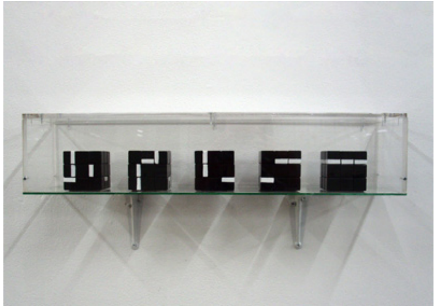
2004, acrylic on rubiks cubes, 54 x 11,5 x 13,5 cm. Exhibition view from Traces du sacré, Haus der Kunst, 2008, München. Courtesy of the artist and BARO galeria, Palma. Ed. of 5 + 1 A.P.